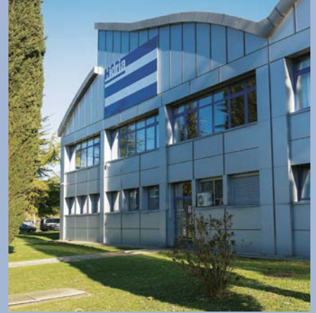
Hidria Alutec – location Koper.