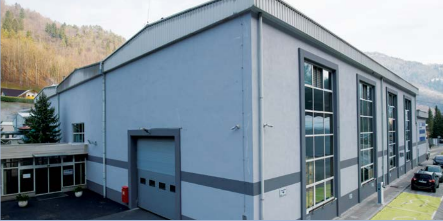
Hidria Alutec – location Spodnja Idrija.