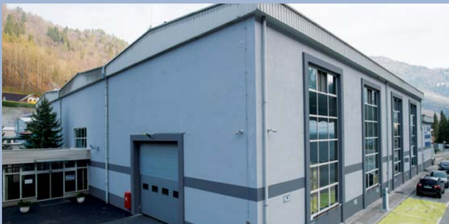
Hidria Alutec – location Spodnja Idrija.