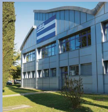
Hidria Alutec – location Koper.